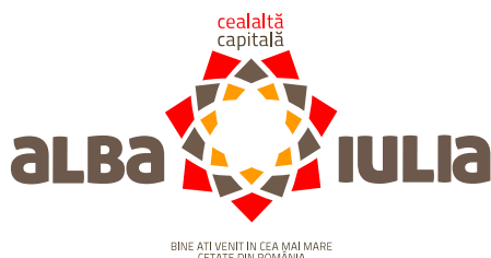
Alba Iulia Municipality (Romania)