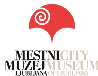
Museum and Galleries of Ljubljana (Slovenia)