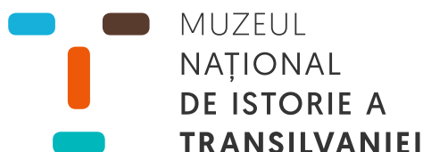
National Museum for the History of Transylvania (Romania)